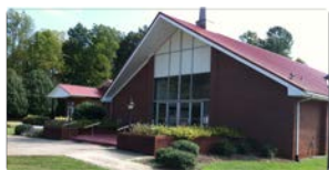
Antioch Missionary Baptist Burlington, NC