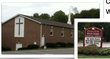
Chadds Ford Baptist, Chadds Ford, PA