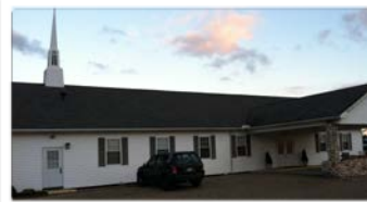
East Sunsbury Baptist, Beallsville, OH