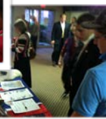
Kids doing the "Kiwi Quiz" at East Side Baptist