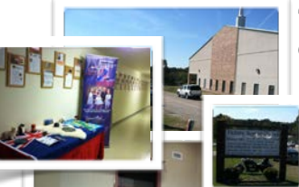
Camp meeting at Victory Baptist, Benton, AR