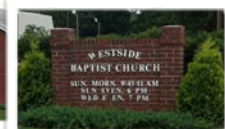
West Side Baptist, Salisbury, NC