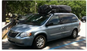
Van loaded with two car carriers on top.

We are into the last half of our itinerary for this year. We have over twenty meetings, including nine mission conferences, in seven different states the remainder of this year. This has been an incredible year for us. God has been so good. Please pray we finish strong as we continue on the deputation trail. We are excited to see what God has in store for next year. Psalm 40 says, "Many, O Lord my God, are thy wonderful works . . . and thy thoughts which are to us-ward . . . Sacrifice and offering thou didst not desire . . . burnt offering and sin offering hast thou not required. Then said I . . . I delight to do thy will, O my God: yea, thy law is within my heart." Thank you for joining us on this journey. Thank you for your faithful prayers and support. Together, we can reach Kiwis for Christ!