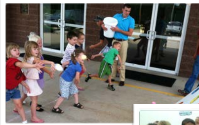
VBS First Baptist, Wayland, MO