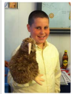
Our pet kiwi puppet, "pokey"