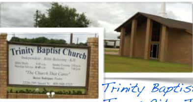
Trinity Baptist, Texas City, TX

This month's letter comes to you from the Finger Lakes Region of New York state. We are busy continuing down the deputation trail. The Lord gave us a great summer after our return from New Zealand. Here are some of the highlights from those meetings.