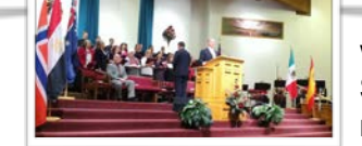
Berean Baptist, Rockford, IL